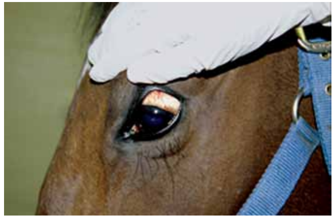
Clinical signs may include redness of the sclera or conjunctiva.

Most horses that become infected with EHV-1 do not go on to develop EHM. Those that do soon become uncoordinated and weak and have difficulty standing. They may also experience difficulty in urinating and defecating. Often the hindlimbs are more severely affected than the forelimbs. Hence, “dog-sitting” is not uncommon in horses