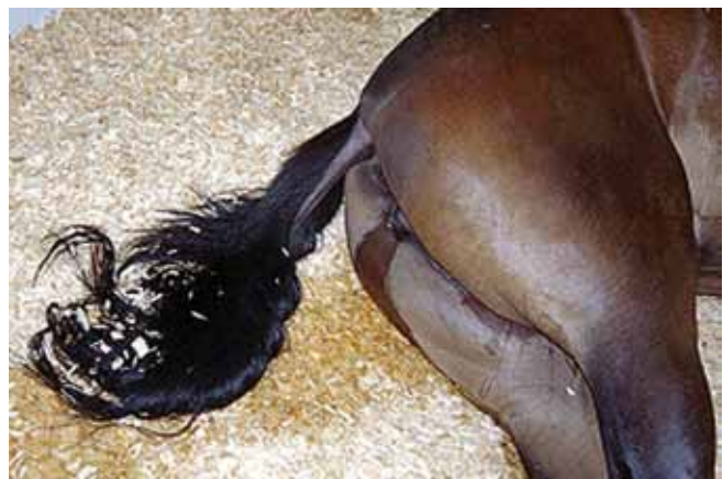
Urine dribbling as well as difficulty in urinating and defecating are also clinical signs of EHM.

Until such time as a vaccine is developed to protect horses from EHM, the best way to prevent the spread of disease is through isolation, quarantine and the practice of biosecurity—a series of management steps taken to prevent the introduction of infectious agents into a herd. All of these preventive measures are discussed in the following sections.