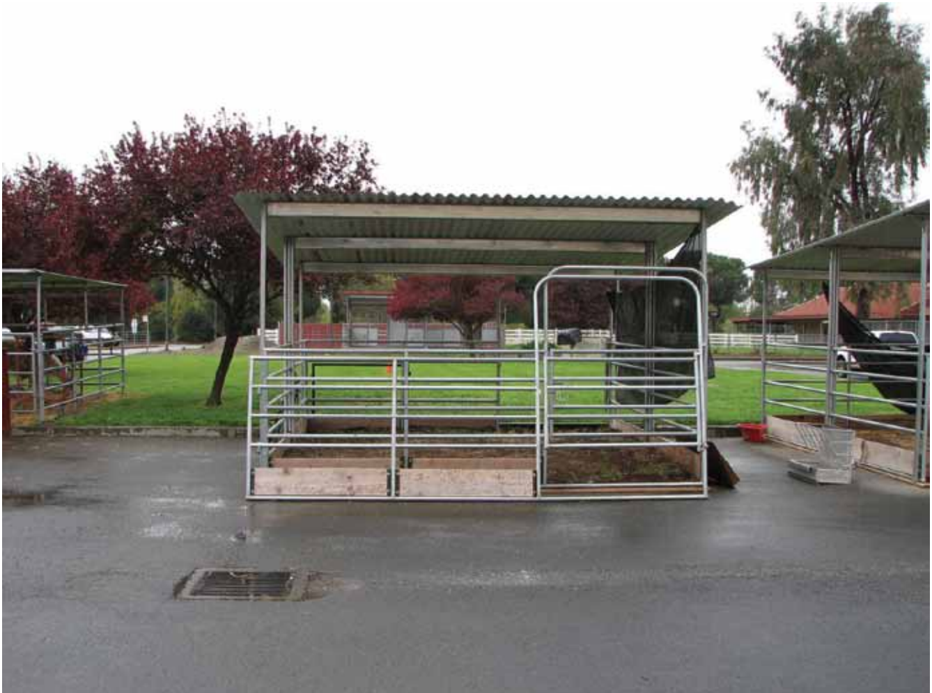
Example of a temporary isolation unit that can be set up at an equine facility or event.

Because the positive predictive value of PCR-based tests for EHV-1 in horses with no clinical signs is uncertain at this time, horses outside of quarantine areas or in unexposed stables should not be tested on a random basis. The finding of a positive PCR test result in an asymptomatic horse does not provide conclusive evidence of either active infection or the potential for disease transmission. Because of the known tendency of EHV-1 for latency, low levels of nonreplicating virus (not capable of spreading infection) may be the source of the viral DNA detected by PCR in an asymptomatic individual.